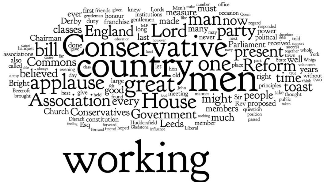
Figure 11: Most commonly used words from the reduced corpus of Yorkshire Working Men's Conservative Association banquets 1865-7, sized by frequency