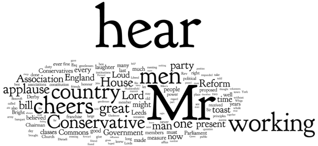
Figure 10: Most commonly used words from the full corpus of Yorkshire Working Men's Conservative Association banquets 1865-7, sized by frequency

To allow a comparison between the full and reduced corpuses, images of both have been included.