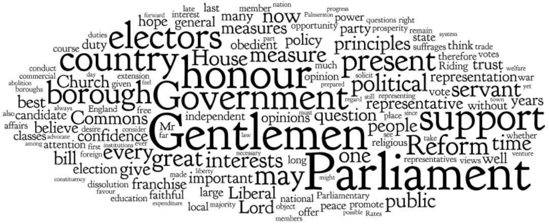
Figure 12: Most commonly used words from the full corpus of Yorkshire election addresses, 1857-65, sized by frequency