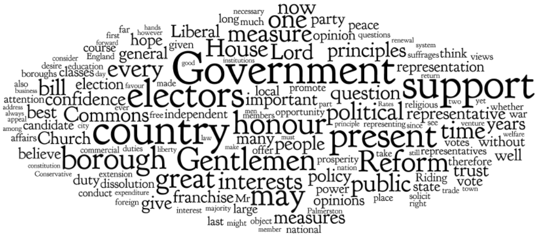
Figure 13: Most commonly used words from the reduced corpus of Yorkshire election addresses, 1857-65, sized by frequency