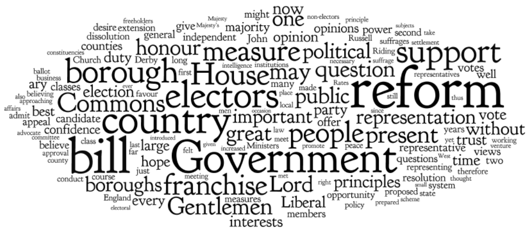
Figure 5: Words used in Liberal addresses at the 1859 election, sized by frequency.

This overall trend is reflected in a more detailed examination of what was said by candidates. Four Conservative candidates broadly denied that the