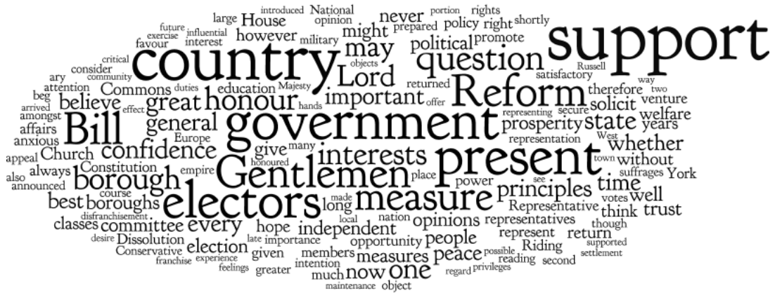
Figure 4: Words used in Conservative addresses at the 1859 election, sized by frequency.